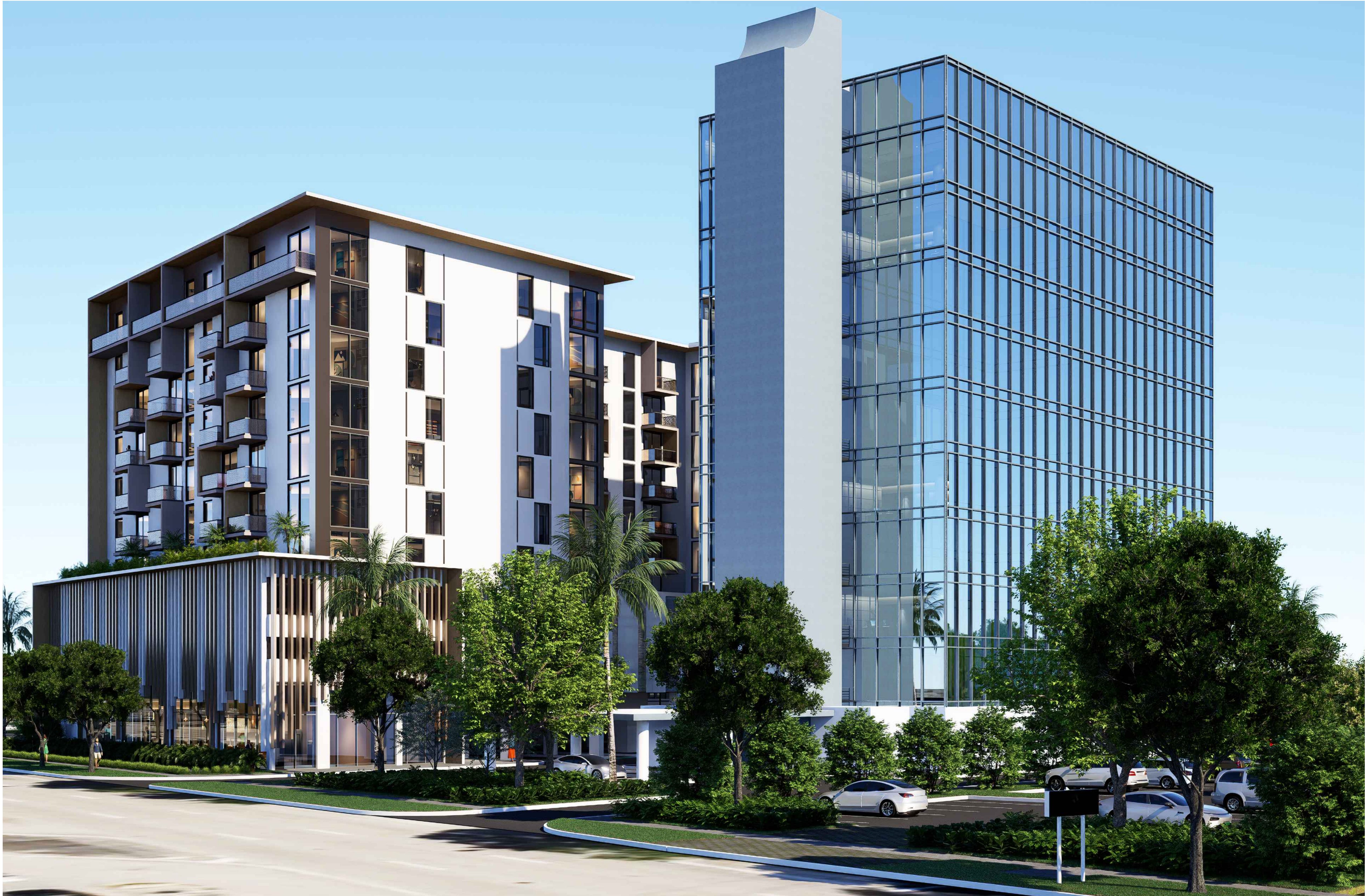
FIRE TRUCK ENTRANCE ON FEDERAL HIGHWAY